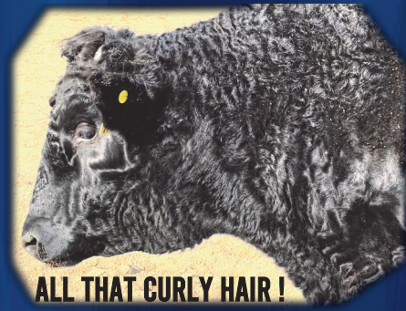
ALL THAT CURLY HAIR!