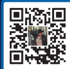
Dean's - QR Contact